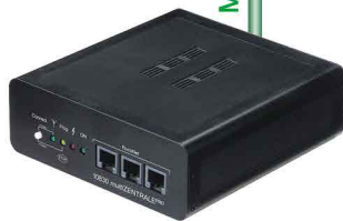
DCC central control unit